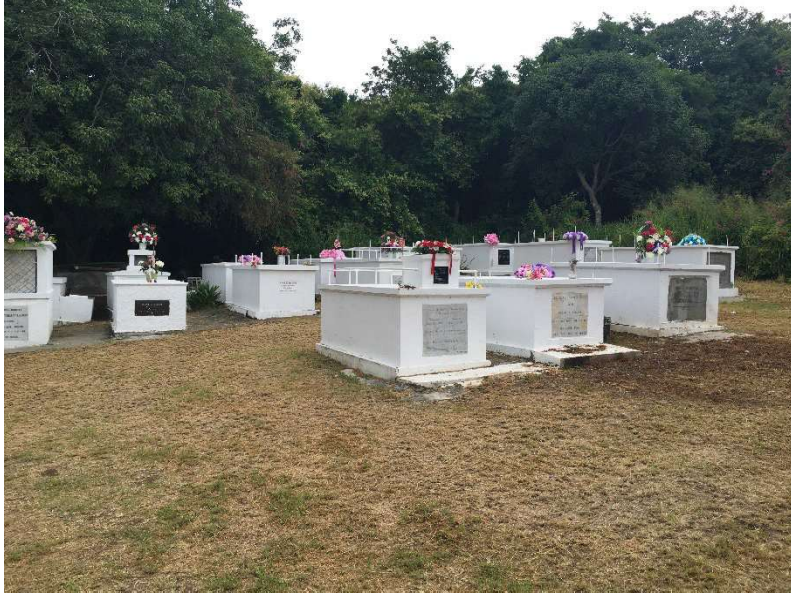
Raimer Family Cemetery