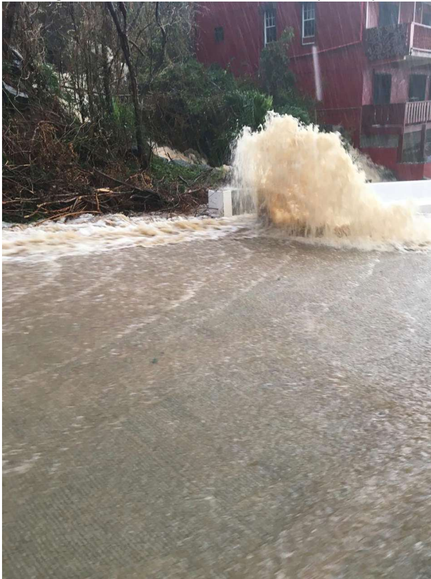
Flooding of Rosendahl Drive after TS Ernesto

Rosendahl Drive and beyond. One main gut borders the proposed road to the development. This gut contributed greatly to the road being washed away completely at the corner of Rosendahl Drive and Magen's Bay Road during Hurricanes Irma and Maria. Some time later Public Works and a company from Puerto Rico worked on the road, focusing on the culvert at our driveway entrance, and tried to create a waterway system to control the waterflow from that gut. However, a good rainfall still turns the road into a river, flooding homes along the way. I posted a picture of the flooding that was taken after TS Ernesto, in the meeting chat. In the meeting we did not have the sense that these developers understood the topography of the area. Rerouting more water to that gut would have disastrous consequences to both the graveyard property at #4 and ours at #4H Estate St. Joseph and Rosendahl, as well as to the homes and property further down the road.