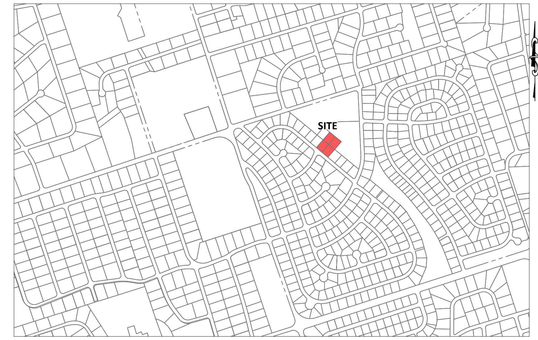
VICINITY MAP (1" = 500 ft)