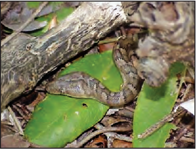
VI tree boas spend most of their time in trees but can occasionally be found around homes and in yards on the ground.

The VI tree boa was included in the federal endangered species list in 1979. It is also included in Appendix I of the Convention on International Trade in Endangered Species (CITES) and locally protected by the VI Indigenous and Endangered Species Act of 1990, Coastal Zone Management Act of 1972. The Endangered Species Act of 1973, as amended, prohibits the killing, harassing, trapping, purchasing or selling any listed species, as well as parts and products derived from the species.