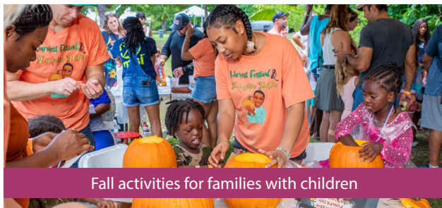
Fall activities for families with children