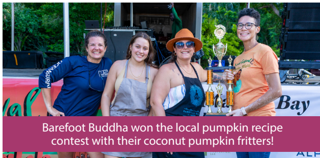
Barefoot Buddha won the local pumpkin recipe contest with their coconut pumpkin fritters!