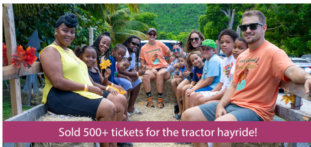
Sold 500+ tickets for the tractor hayride!