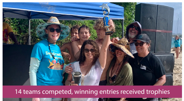
14 teams competed, winning entries received trophies