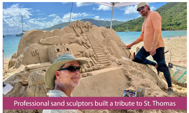
Professional sand sculptors built a tribute to St. Thomas