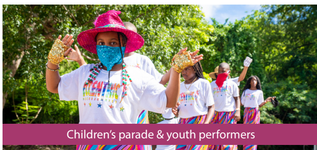
Children's parade & youth performers