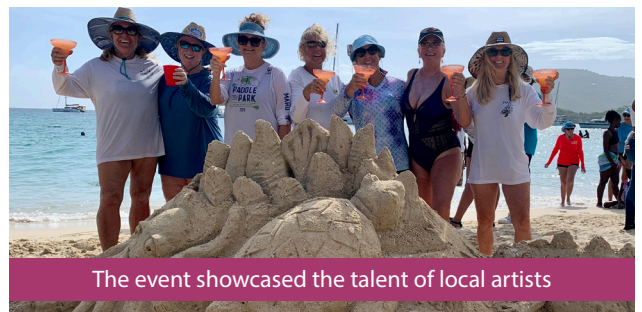
The event showcased the talent of local artists