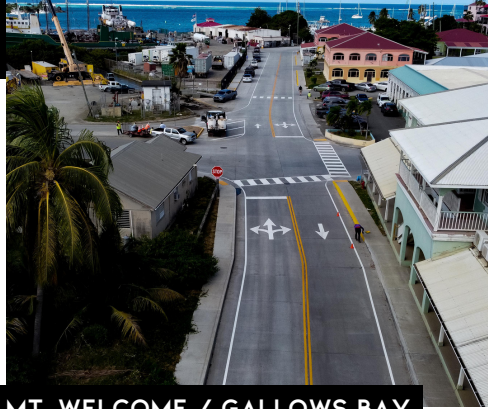
MT. WELCOME / GALLOWS BAY