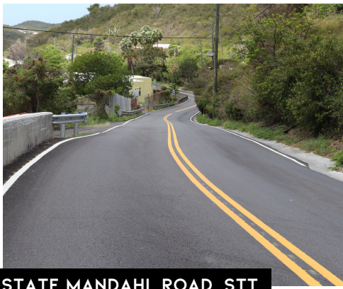
ESTATE MAND AHL ROAD, STT