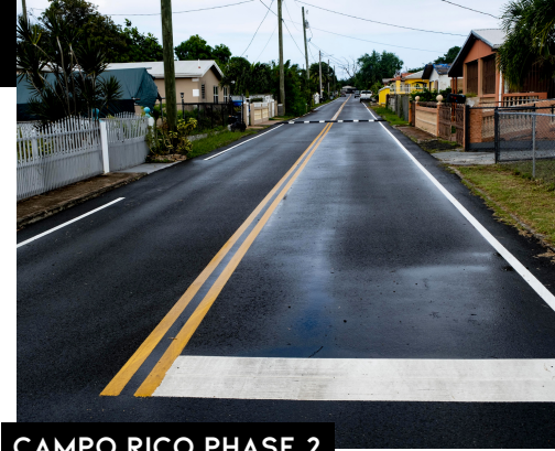
CAMPO RICO PHASE 2