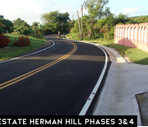
ESTATE HERMAN HILL PHASES 3&4