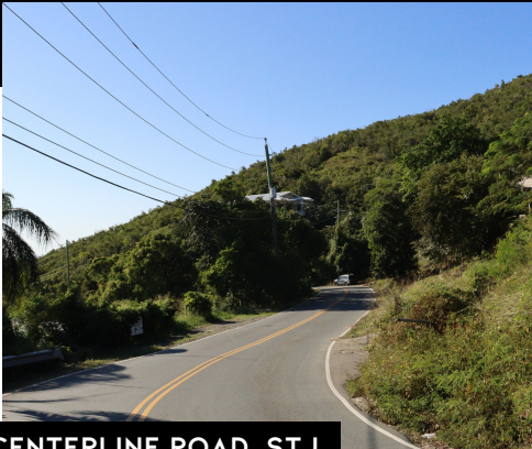
CENTERLINE ROAD, STJ