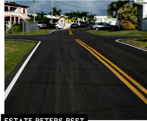
ESTATE PETERS REST