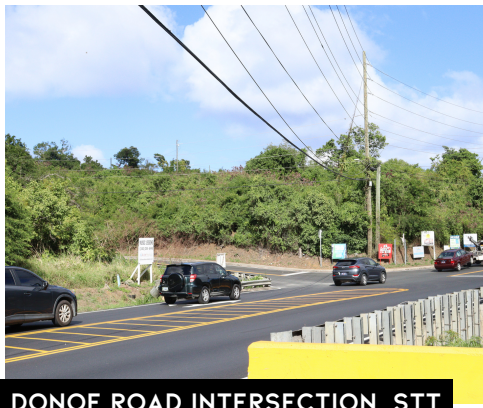
DONOE ROAD INTERSECTION, STT