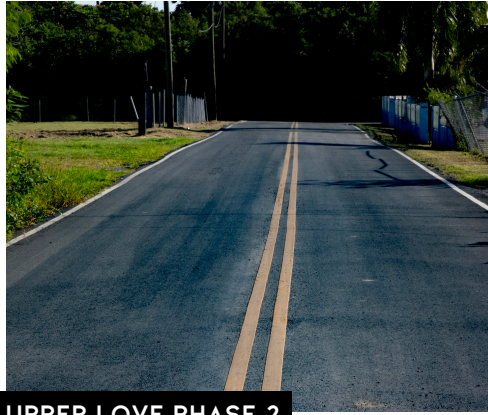
UPPER LOVE PHASE 2