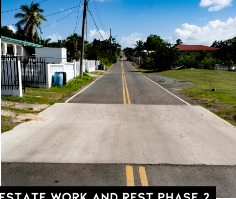
ESTATE WORK AND REST PHASE 2