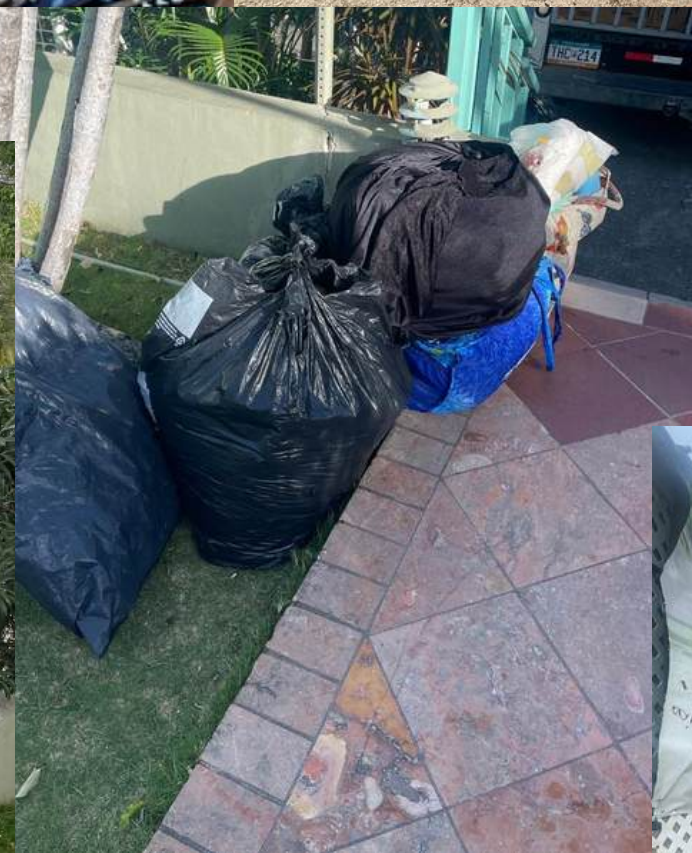
Improper disposal of oil waste and general garbage on our property