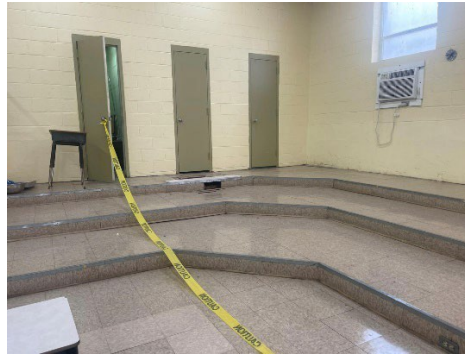
Beautiful but Condemned Music Room