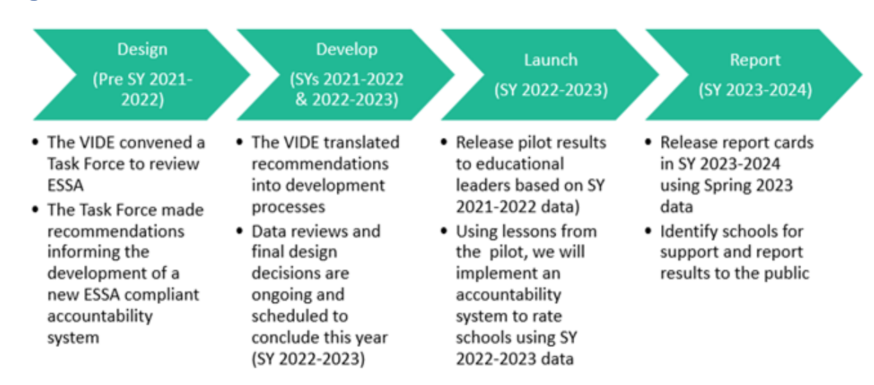
Figure 1: Timeline

The star ratings for each school will be based on how they perform on four indicators; (achievement, growth/graduation, EL proficiency, and absenteeism rates) for all students and each student group. As a department, we must have a system of support and intervention for schools when students overall (or if any group) are struggling. Our one-and two-star schools will require comprehensive support and intervention and will work directly with their district and the state to engage in comprehensive improvement efforts. As we get closer to the launch of these ratings, there will be public engagement so that the territory understands how the Department will address student performance.