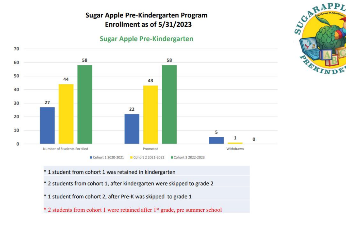
Figure 3: Participation and Student Progress

For SY2023-2024, two additional classes will be added at the Ulla F. Muller Elementary School and the Joseph A. Gomez Elementary School, with an anticipated enrollment of 65 students. See Figure 3, which outlines participation and student progress.