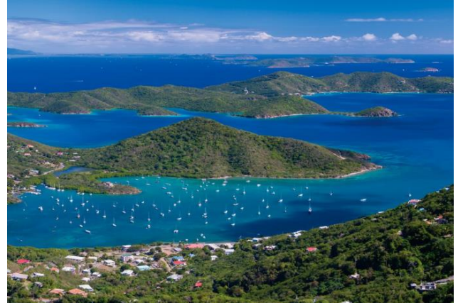
St. John U. S. Virgin Islands - Coral Bay

The Summer's End Group, LLC, is developing the first and only marina on the island of St. John, U.S. Virgin Islands (USVI). St. John is known as the jewel of the Caribbean with more than 2/3rd of the island designated as National Park. St. John is the only major Virgin Island—US or British—that does not have a marina facility!