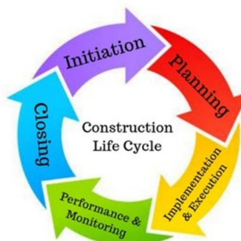
Figure 2: Construction Life Cycle

Capital improvements are made on a cycle as shown in Figure 2 below. The initiation phase was done over 18 months by VIDE with the New Schools Construction Advisory Board comprised of Senators, VIDE leadership, unions leaders, community members, parents and students. The board continued to work with the educational facility planning and design firm, DLR Group, for six (6) more months to complete the planning. The Educational Facility Master Plan, approved by Governor Albert Bryan, Jr. in June 2020, shows the right-sized footprint of the future with space for 40 years of growth.