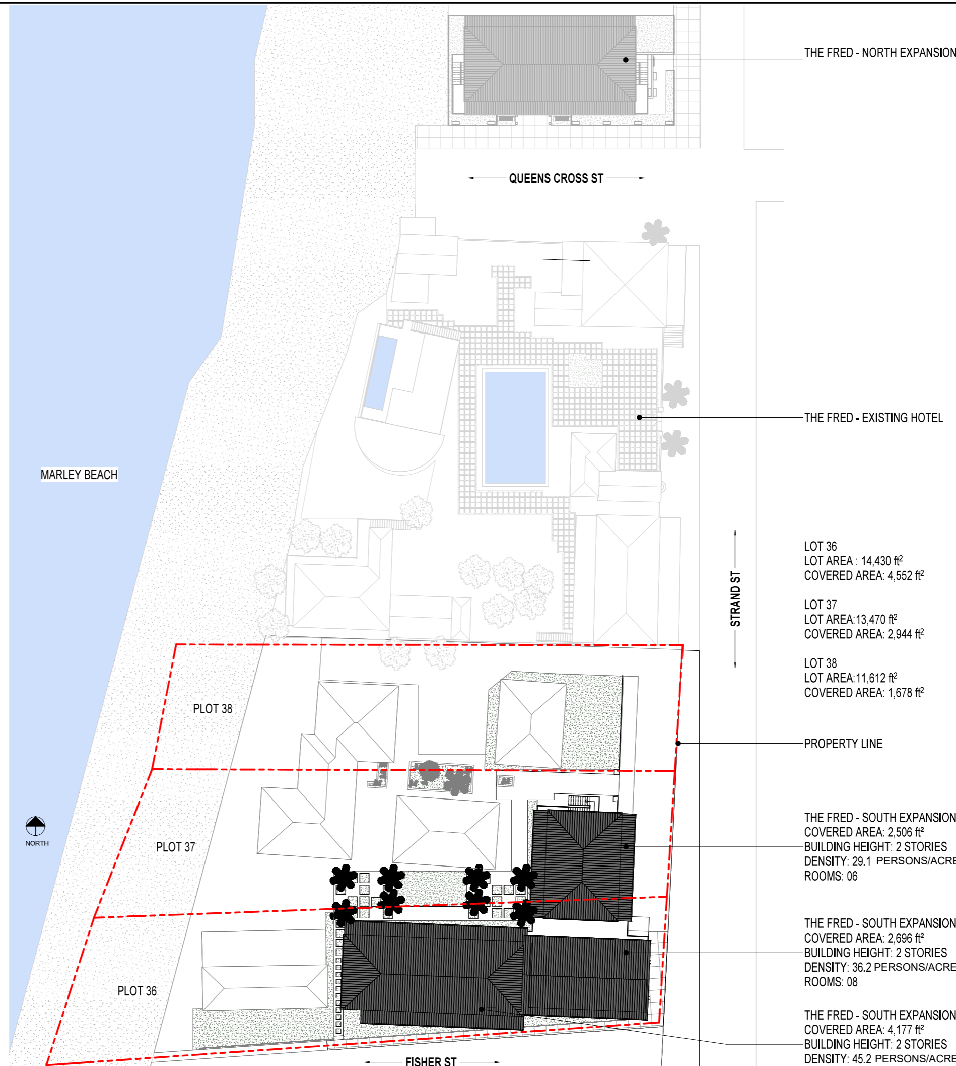
1 R.01 SITE PLAN - REZONING SCALE: 1/16" = 1'-0"