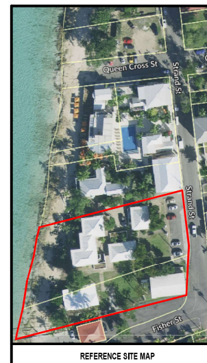
REFERENCE SITE MAP

THE FRED - SOUTH EXPANSION 36-38 STRAND ST, ST. CROIX, USVI NEXT TO THE FRED LLC SITE PLAN - REZONING