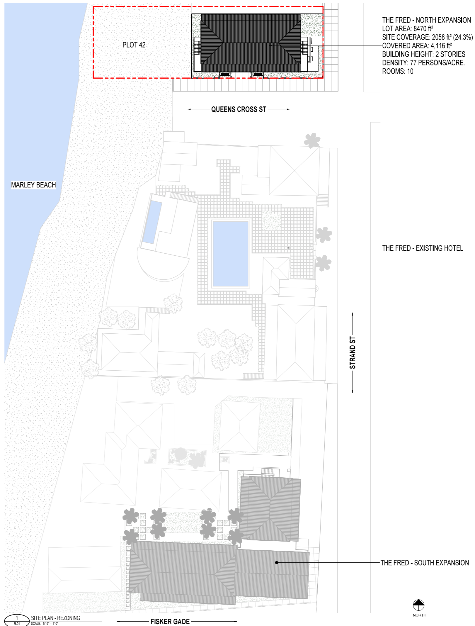
1 SITE PLAN - REZONING SCALE: 1/16" = 1'-0"

THE FRED - NORTH EXPANSION LOT AREA: 8470 ft 2 SITE COVERAGE: 2058 ft 2 (24.3%) COVERED AREA: 4,116 ft 2 BUILDING HEIGHT: 2 STORIES DENSITY: 77 PERSONS/ACRE. ROOMS: 10