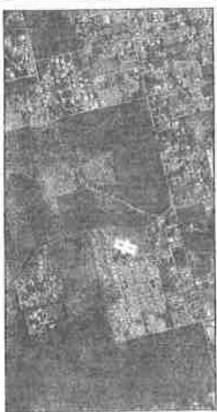
VICINITY MAP (Not to Scale)

Engineers • Surveyors • Planners 5011 Chandler's Wood, Charlottesville, VA 22904 Phone: 803.737.1111 Fax: 803.737.1118