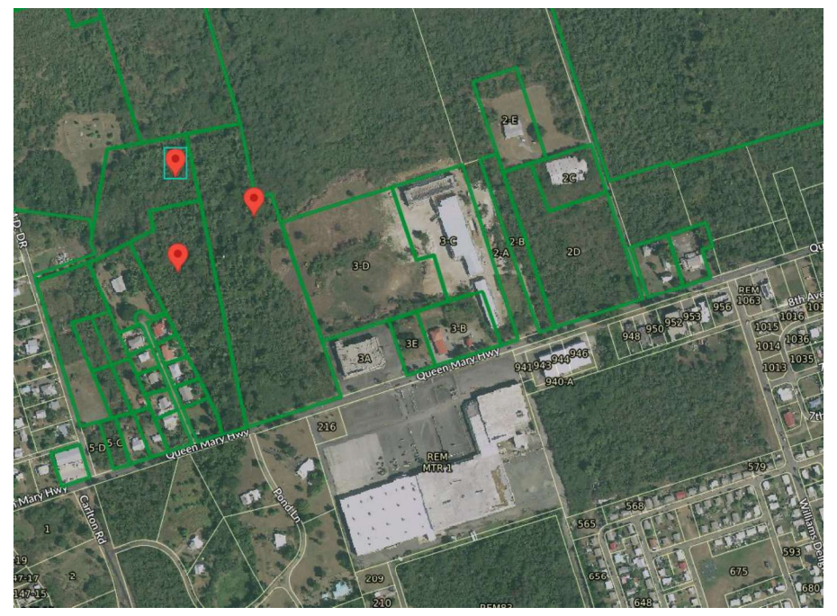
MapGeo aerial view of properties (marked in red)

rezoned to B-2 (Business-Secondary/Neighborhood by Act No. 5403). To the west is residential development.