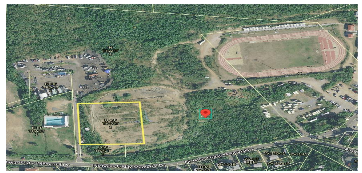
MapGeo aerial view of property (marked in red)

The surrounding areas are zoned R-2 and W-1 (Waterfront-Pleasure) with two rezonings.