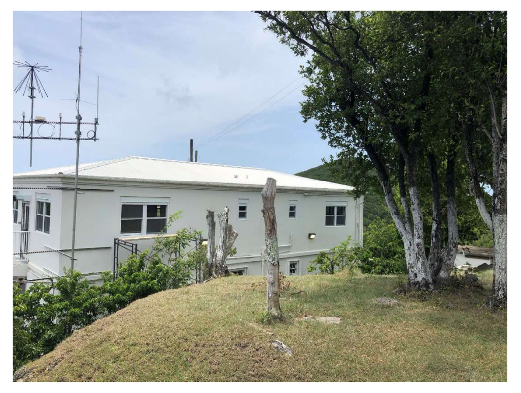
Figure 13: DPW / VITEMA Office Building