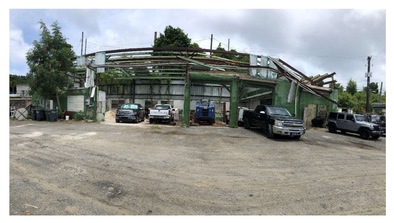
Figure 2: Hurricane Damaged Maintenance Building