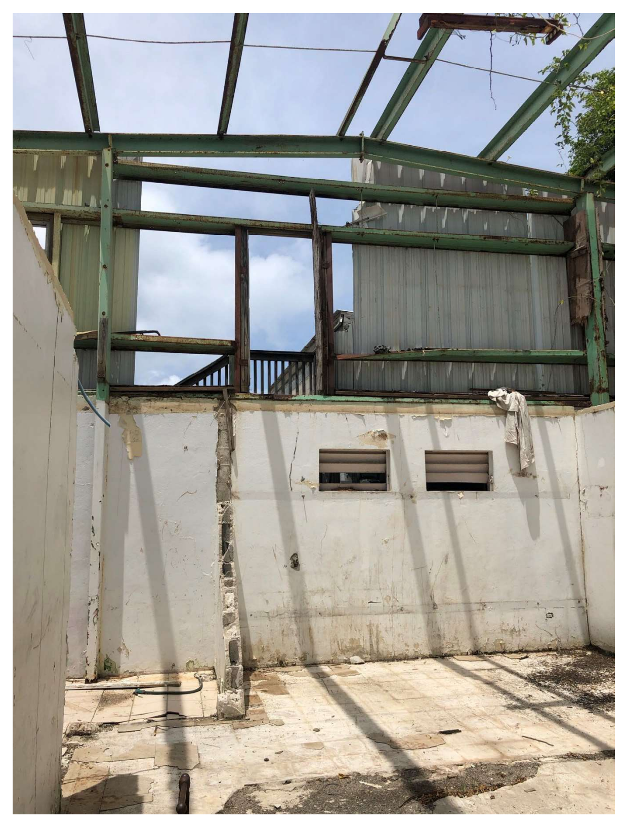
Figure 7: Hurricane Damaged Maintenance Building