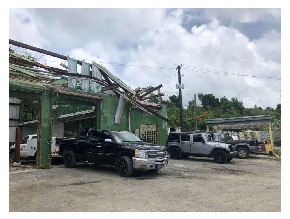
Figure 4: Hurricane Damaged Maintenance Building