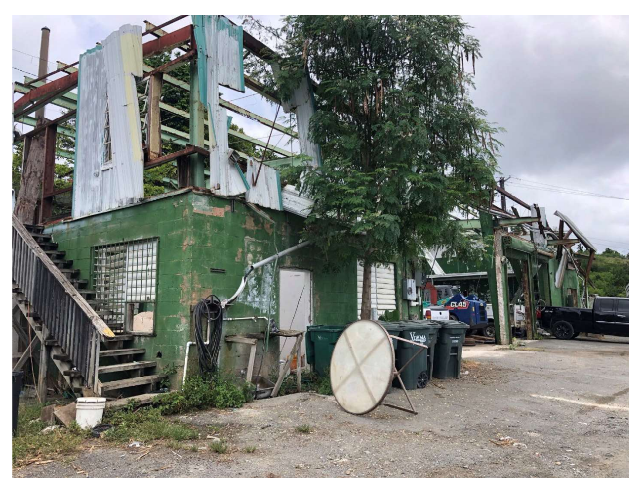
Figure 8: Hurricane Damaged Maintenance Building