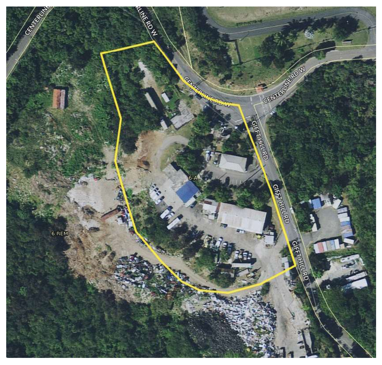
Figure 1: Aerial View of Site