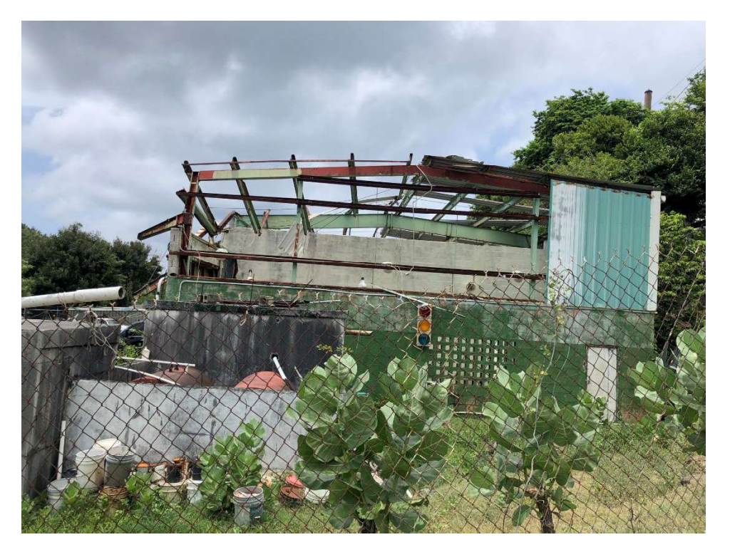
Figure 12: View From Public Road