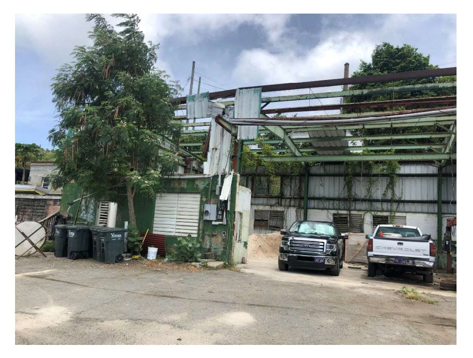
Figure 5: Hurricane Damaged Maintenance Building