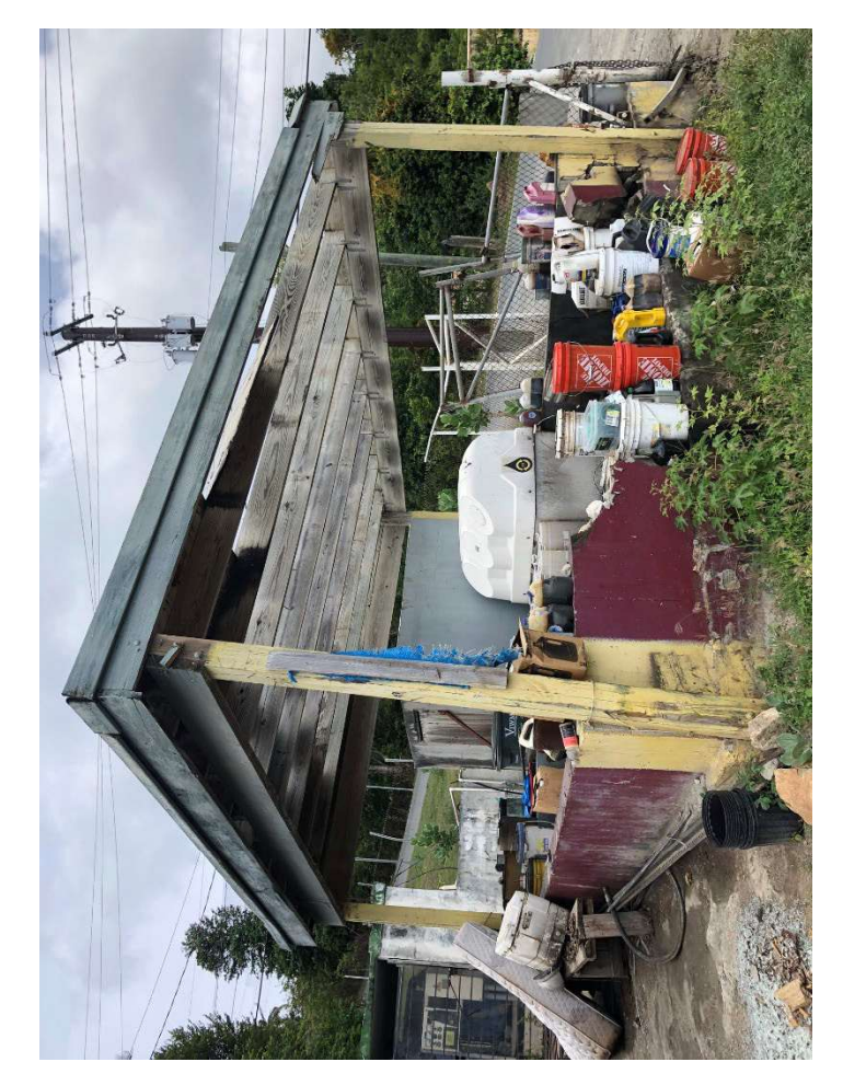
Figure 10: Hurricane Damaged Maintenance Building