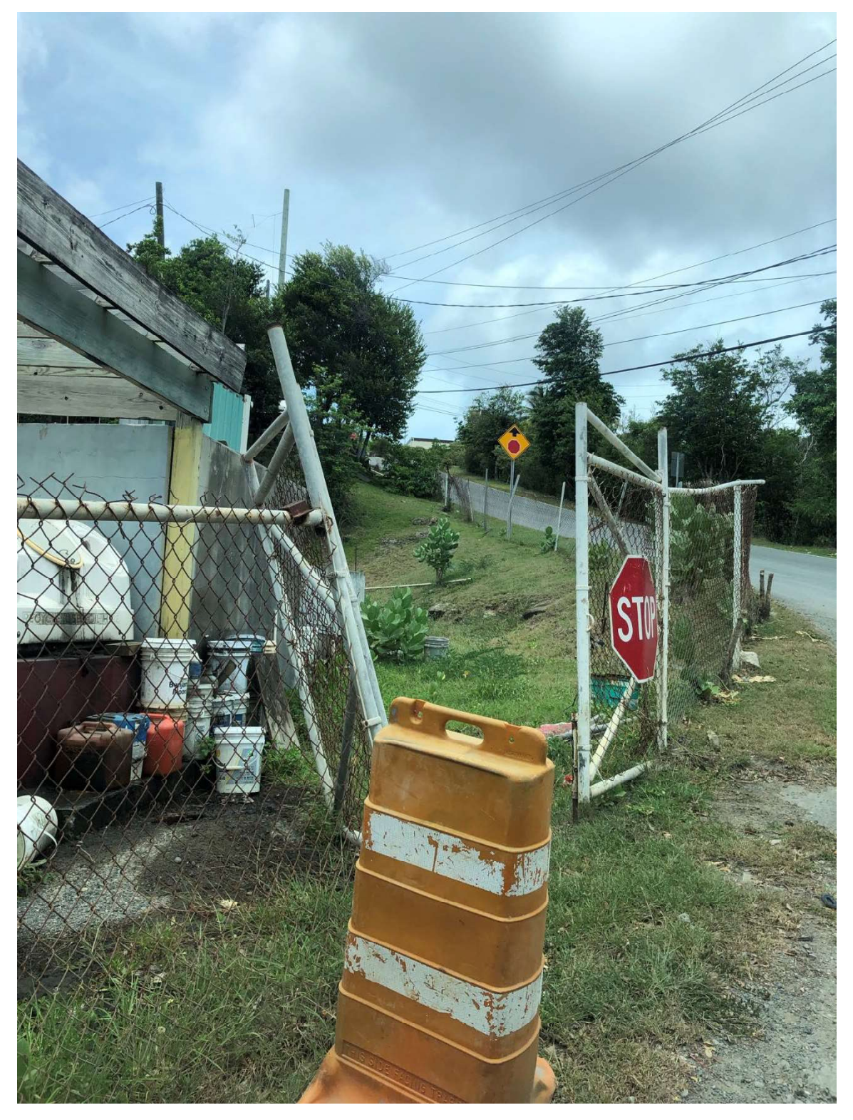
Figure 11: View along Public Road