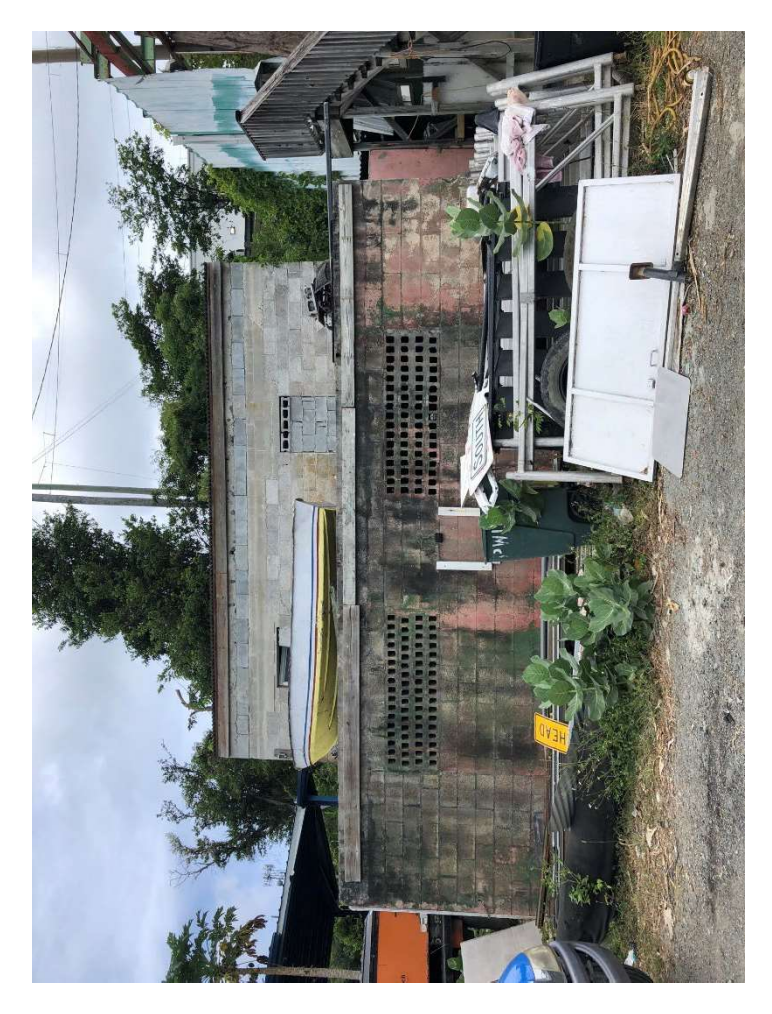
Figure 9: Hurricane Damaged Maintenance Building