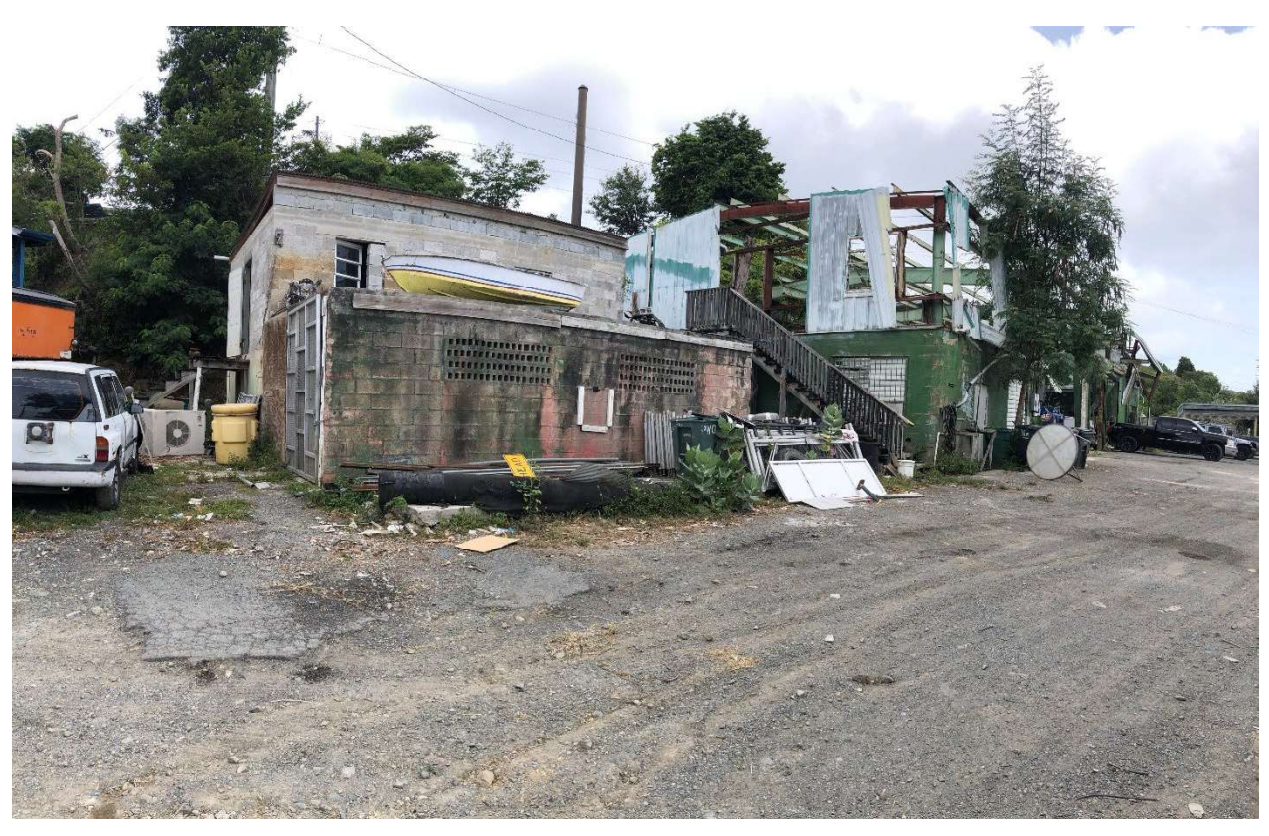
Figure 3: Hurricane Damaged Maintenance Building